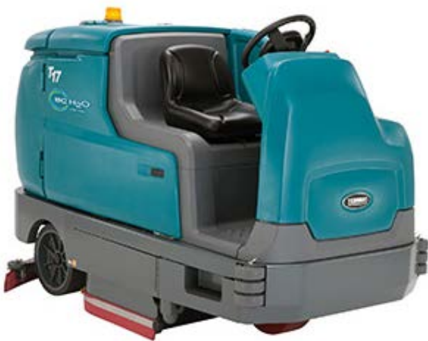
Tennant T17 Rider