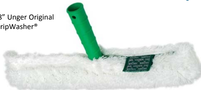
18" Unger Original StripWasher®